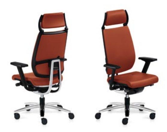
Swivel chair with fully upholstered backrest, headrest, height-adjustable backrest, depth-adjustable lumbar support, 3D adjustable armrests, polished aluminium base