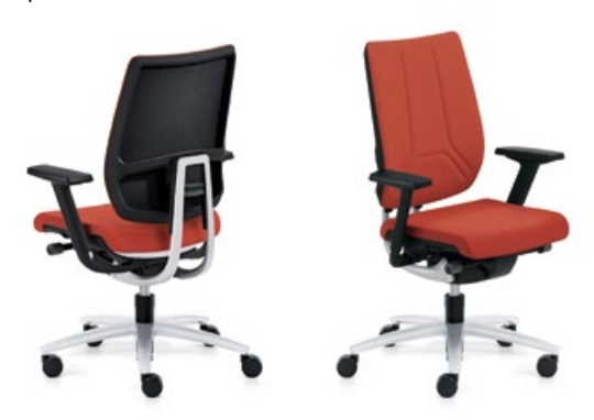
Swivel chair with membrane backrest with flat cushion, 3D adjustable armrests, powder-coated aluminium base in white aluminium