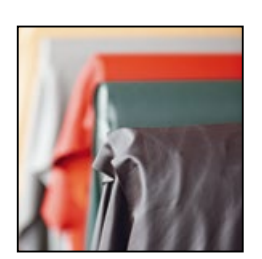
Local leather. Firstclass quality and short transport routes – all the leather we use comes from Southern Germany and Austria.