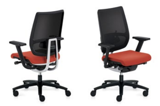
Swivel chair with membrane-covered backrest, 3D adjustable armrests, powder-coated aluminium base in black