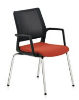
4-leg model with membrane-covered backrest, chromed steel frame, stackable